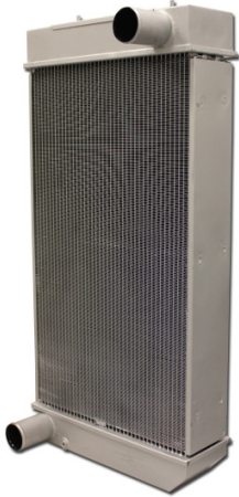
Grayson Part No: RR-5056-000 O.E Number: 101992

Description: Dennis Elite, Cummins Engine Euro 3.5. Fits with AC-5046-000 Dimensions: Length: 708mm Width: 418mm Depth: 110mm