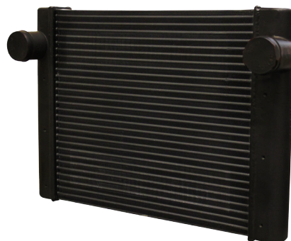
Grayson Part No: IU2DN300 O.E Number: 100805

Description: Dennis Elite, Cummins Engine 3.5 Dimensions: Length: 745mm Width: 306mm Depth: 76mm