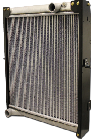
Grayson Part No: RR-5096-000 O.E Number: 102386

Description: Dennis Elite Euro 4 & Euro 5, Volvo Engine. Fits with AC-5087-000 Dimensions: Length: 708mm Width: 421mm Depth: 125mm