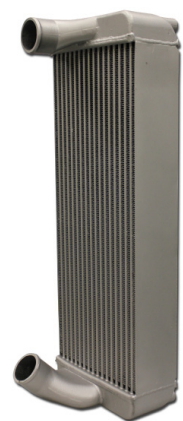
Grayson Part No: AC-5087-000 O.E Number: 102579

Description: Dennis Elite re-design. Fits with RR-5096-000 Dimensions: Length: 764mm Width: 534mm Depth: 76mm