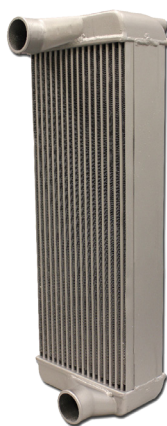
Grayson Part No: AC-5046-000 O.E Number: 101990

Description: Dennis Elite Intercooler. Fits with RR-5096-000 Dimensions: Length: 503mm Width: 646mm Depth: 50mm